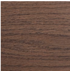
Walnut Stained Oak