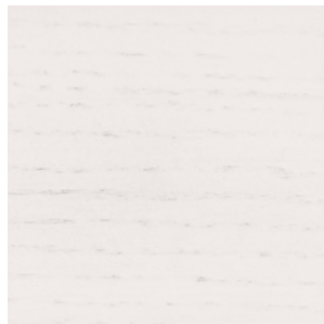
White Stained Oak