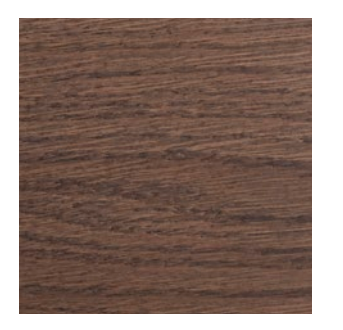
Walnut Stained Oak