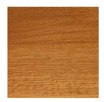
Orange 19 Oak Stain