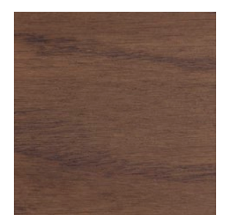
Ash Grey Oak