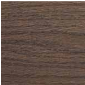
Walnut Stained Oak