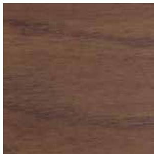
Ash Grey Oak