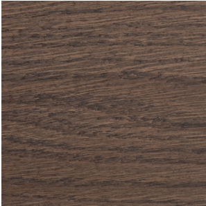
Walnut Stained Oak