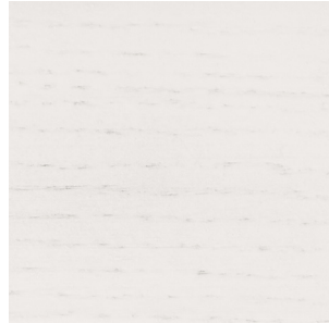
White Stained Oak