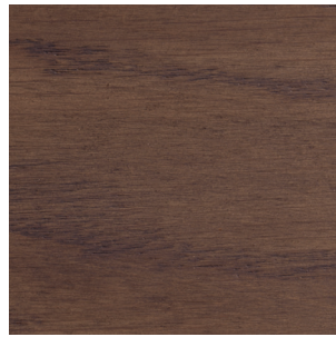
Ash Grey Oak