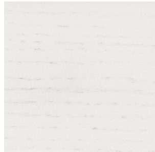
White Stained Oak